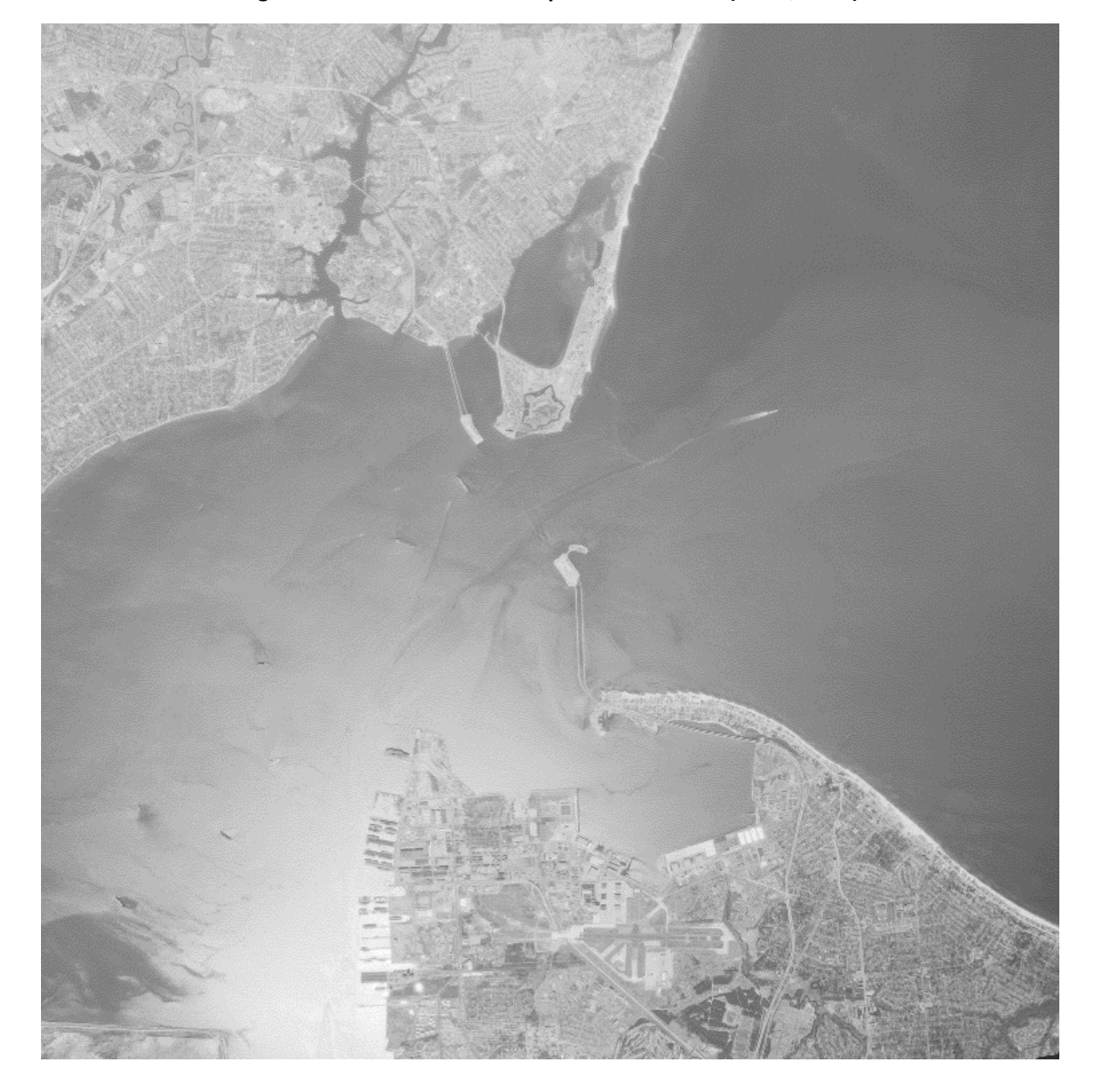
Figure F-7: 1983 Aerial of Hampton and Norfolk (USGS, 1983)